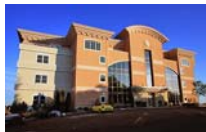
Oceania is a 16-unit residential condominium project located in Hull, Mass.

HULL, MASS. — Flynn / Boston Realty Advisors has arranged the sale by auction of seven residential condominium units at Oceania, a newly constructed condo property located in Hull, for a combined $4.5 million. Oceania contains 16 units in a mix of two- and three-bedroom units. Many of the units include offices/dens, as well as large balconies overlooking Cape Cod Bay and the Boston skyline. Winning bids ranged from $530,000 for a 2,882-square-foot unit to $875,000 for a 2,798-square-foot penthouse unit that features its own roof deck. These units were originally priced at $1.22 million and $1.42 million, respectively. Oceania is owned by Weymouth, Mass.-based Seven Hills LLC.