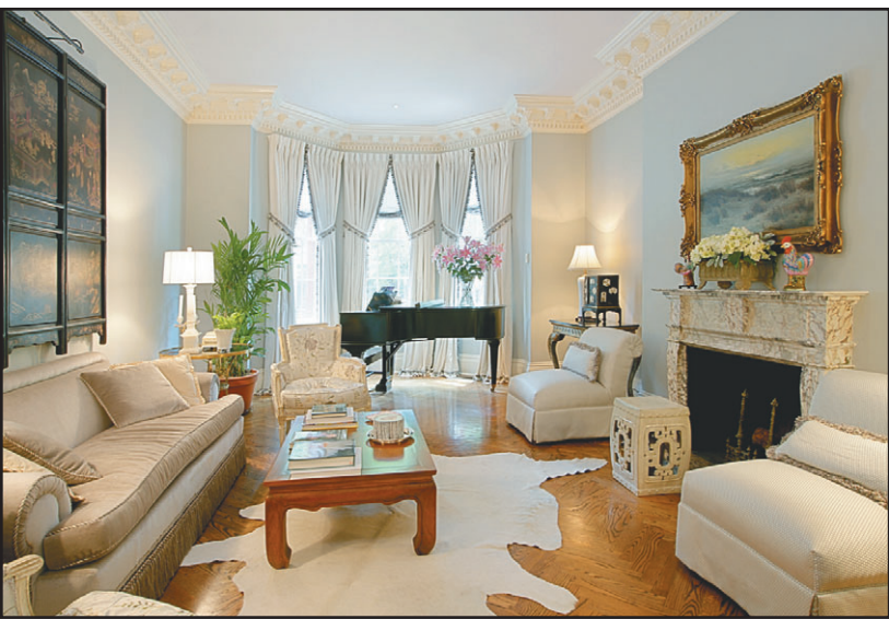
The living room of Unit 2 at 249 Marlborough St. in the Back Bay is absolutely exquisite.