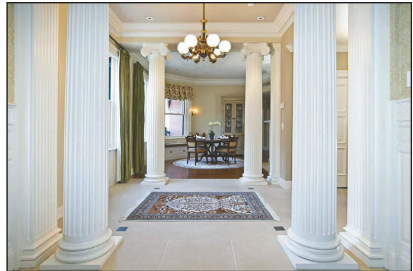
Decorative pillars grace the entryway of Unit 2 at 29 Fairfield St. in the Back Bay, and a white glass Victorian chandelier from an old Worcester bank hangs from the ceiling.