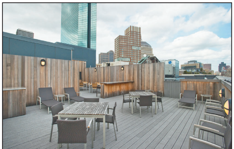
The residences at Columbus Lofts, 285 Columbus Ave., in the South End, have direct elevator access to the spacious roof deck. The sweeping views extend to Marina Bay in Quincy.