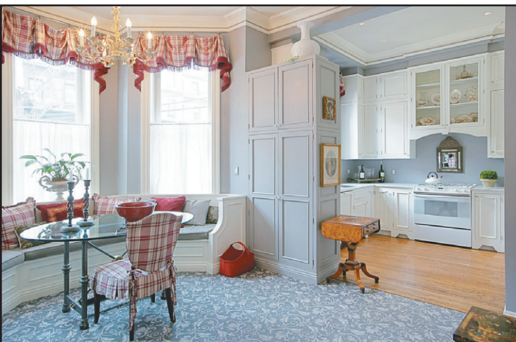
The family room, which is adjacent to the spacious kitchen, can serve as a breakfast room as well.

An elevator in the hallway allows groceries to be easily carried from the car to the kitchen level.