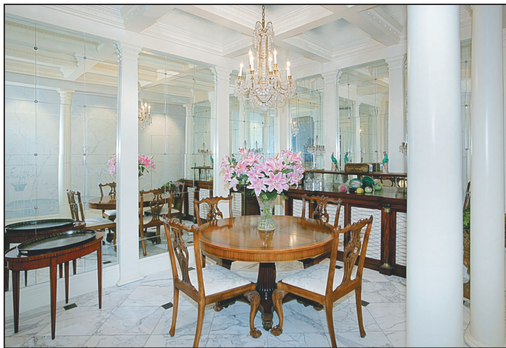
The mirrored dining room reflects the columns and crystal chandelier, further enhanced by the silver leaf in between the ceiling coffers.

More built-ins are in the fireplace wall and across from it, and opposite the sofa wall, a bay holds a built-in banquette seating area where informal meals or board games can be enjoyed.