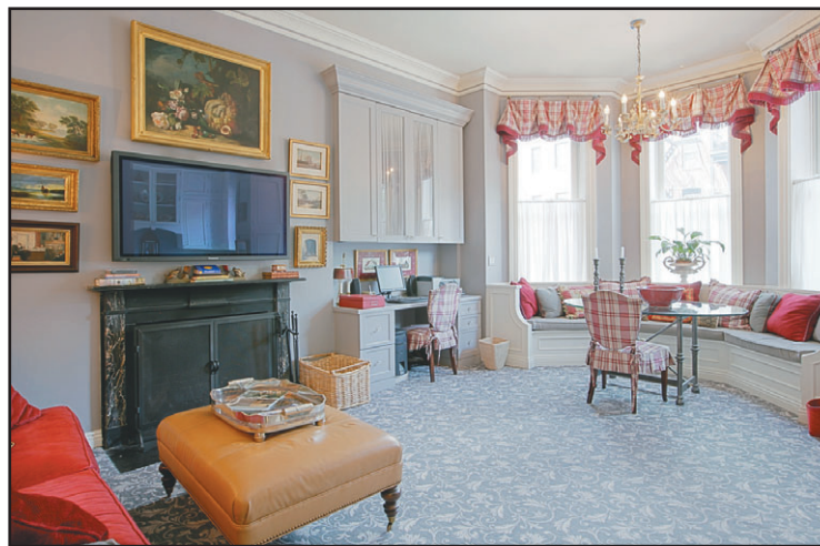
The carpeted family room features a wood-burning fireplace with a mantelpiece of black marble veined in gray. The 50-inch HD flat-screen television is included in the sale.